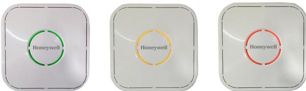
Three-color Indicator light

There is a circle ring of indicator light in the center of the housing. This indicator light is used to show concentration range of measured value.