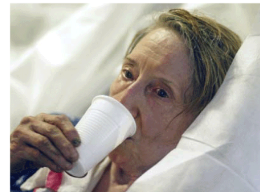
An elderly woman drinks after she was brought by firefighters to the Saint Antoine hospital in Paris, Monday, 11 August 2003.